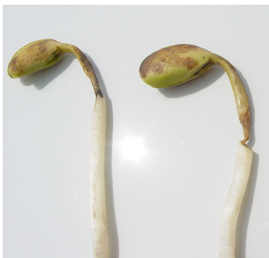
Soybean seedlings with damping off symptoms due to Pythium seedling blight.