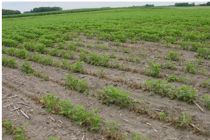
Soybean field showing stand reduction due to fusarium root rot.