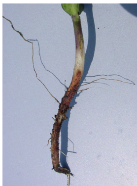
Symptoms of Rhizoctonia root rot. Note the red discoloration.