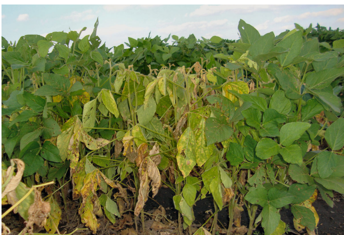
Soybean plants wilting due to Phytophthora root and stem rot.