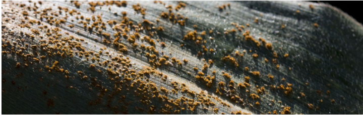
Figure 5. Corn leaf infected with southern rust. Note round to oval pustules, light brown to orange in color.