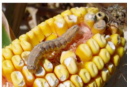
Figure 2. CEW feeding in a straight line down the ear. Corn earworms are cannibalistic so there is typically only one found per infested ear.