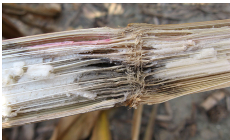
Figure 8. Stalk depicting both anthracnose and Gibberella stalk rot.