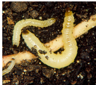
Figure 1. CRW larvae feeding on corn root.