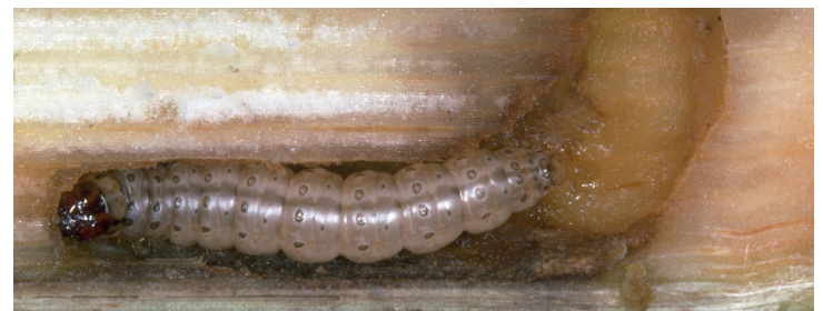
Figure 3. ECB larvae tunneled into corn stalk.