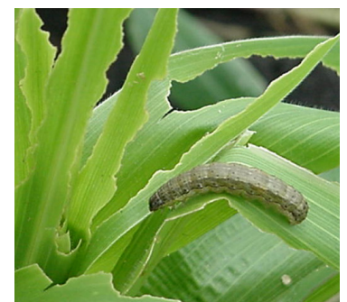
Figure 4. Fall armyworm feeding on vegetative tissue.