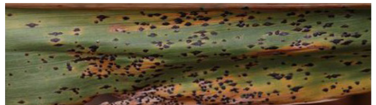
Figure 11. Tar spot of corn leaf.