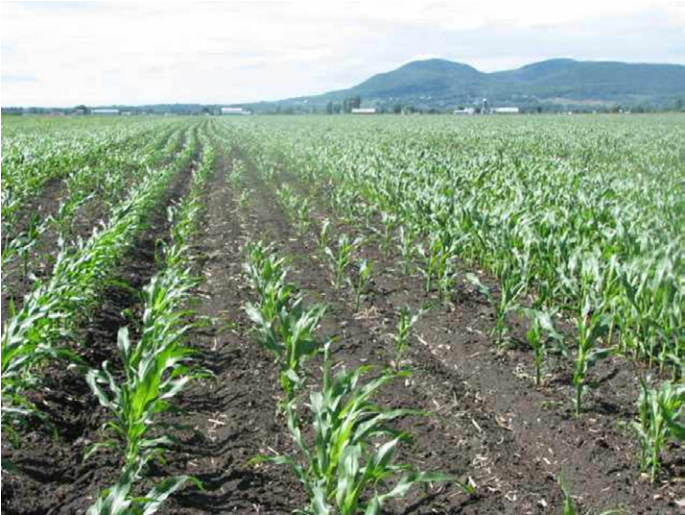
Corn field with stand loss due to seedling disease.

Insecticide seed treatments have no direct activity against diseases but may contribute to disease control in a secondary way. By reducing insect feeding on roots and plants, insecticide seed treatments reduce the points of entry into the seedling by pathogenic fungi.