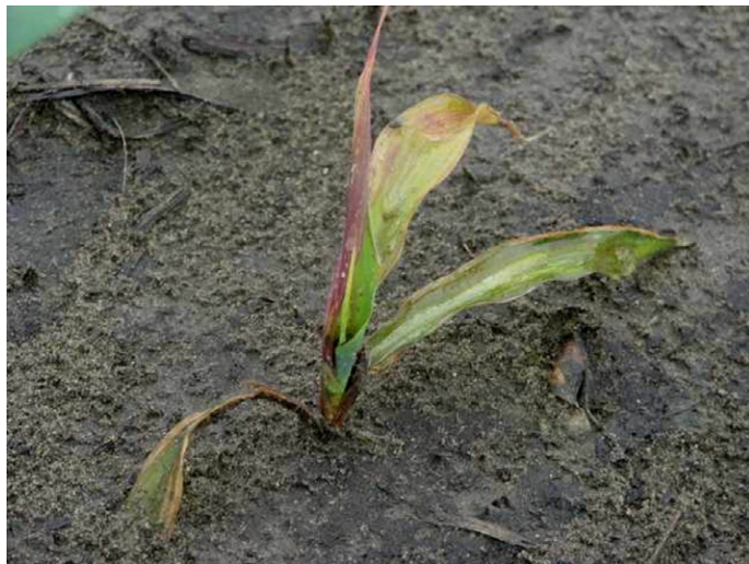
A corn plant infected with seedling disease. This field experienced cold conditions and saturated soils after planting.

The effect of soil-borne diseases on stand establishment and plant development depends largely on the duration of adverse weather and the prevalence of other factors that affect overall plant health, emergence, and early growth. Soil compaction, heavy crop residues, crusting, herbicide or fertilizer injury, and excessive planting depth can all weaken the plant, delay emergence, and increase the susceptibility of corn seedlings to diseases.