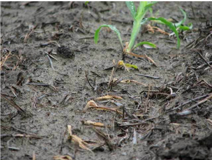
Several corn plants in a row dead from seedling disease in a field that experienced cold and wet conditions after planting.

For further diagnosis of plants with aboveground symptoms, carefully dig up living plants, wash the soil from the roots, and look for rotted tissue and discolored lesions on the plant stem, crown, and roots. Discoloration may range from whitish pink to gray, to dark brown or black, or even greenish blue, depending on the array of pathogens involved.