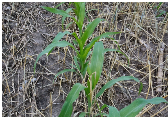
Corn growing in killed rye stubble. Rye can serve as a green bridge for soilborne pathogens that attack corn seedlings.

Growers should begin their corn planting in fields with lighter soils, good drainage, and minimum residue over the row. In heavy-textured, low-lying, or high-residue fields, especially those with a history of seedling diseases, early planting in cold soils is not recommended. Generally, growers should wait until soil temperatures rise above 50°F (10°C) and are likely to remain there before planting corn in those fields.