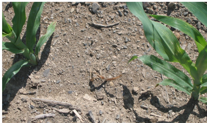
Figure 1. Corn plant that succumbed to seedling disease neighbored by two healthy plants.

At the field level, seedling disease may be slight to severe. Early symptoms of slow growth, chlorosis, stunting, and missing plants may be followed by near complete recovery if favorable conditions allow corn to outgrow the injury. But if cold, wet conditions continue, symptoms often worsen and stands decline. Missing plants may be in patches or scattered among other plants. Often, a chlorotic, stunted plant will appear next to a healthy one (Figure 1). Symptoms may be more noticeable in low-lying areas of the field. These are not typical symptoms associated with other seedling problems such as fertilizer or herbicide injury, nutrient deficiency, or restricted growth due to compaction or crusting.