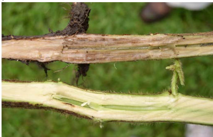
Split soybean stem on top shows stem symptoms of sudden death syndrome infection. Split stem on bottom is healthy.

However, these fungal colonies may not appear if the soil is too dry or too wet. Splitting the root reveals that the cortical cells have turned a milky gray-brown color while the inner core, or pith, remains white. The general discoloration of the outer cortex can extend several nodes into the stem, but its pith also remains white.