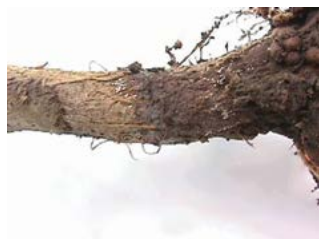
SDS-infected stem and root. Note blue mold at soil line.

SDS begins as a root disease that limits root development and deteriorates roots and nodules, resulting in reduced water and nutrient uptake by the plant. On severely infected plants, a blue coloration may be found on the outer surface of tap roots due to the large number of spores produced.