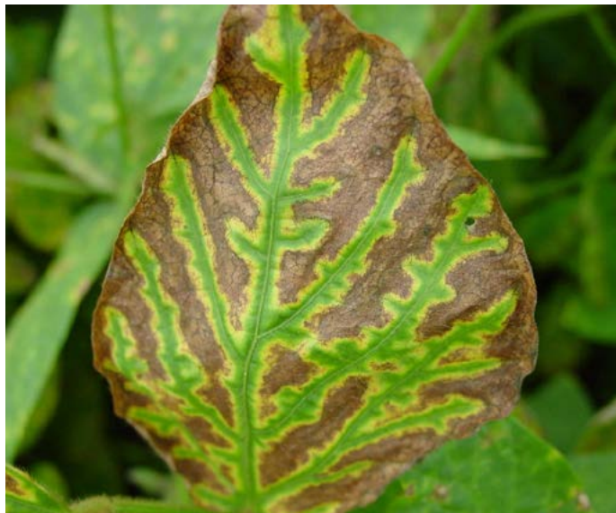
Soybean leaf showing classic symptoms of sudden death syndrome infection, with yellow and brown areas contrasted against a green midvein and green lateral veins.

emergence. However, above-ground symptoms occur much later when the fungus produces a toxin that damages the leaves. This article will discuss the environmental conditions leading to SDS development, the symptoms it causes in soybeans, and the management strategies growers can use to limit its damage to the crop.