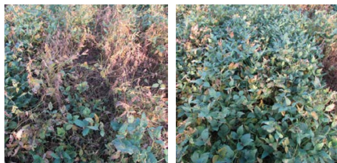
Figure 2. Soybeans treated with FST/IST (left) and FST/IST + ILeVO® fungicide (right) at a research location with SDS near Lawrence, KS.