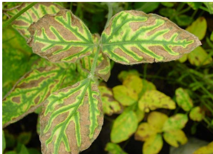
Soybean leaf symptoms of sudden death syndrome infection. Rapid drying of necrotic areas can cause curling of affected leaves.

As these chlorotic areas begin to die, the leaf symptoms become very distinct, with yellow and brown areas contrasted against a green midvein and green lateral veins. Rapid drying of necrotic areas can cause curling of affected leaves. Leaves drop from the plant prematurely, but leaf petioles remain firmly attached to the stem.