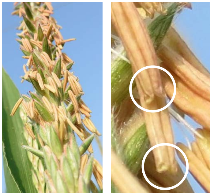
Figure 1. Corn tassel showing open anther pores.