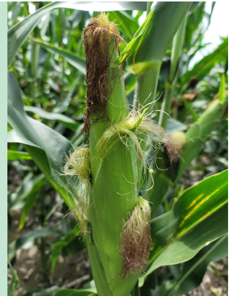
Figure 1. Corn ear with a primary ear and multiple secondary ears growing from the same ear shank.

Much as apical dominance in the plant suppresses development of ears at additional stalk nodes, hormonal apical dominance expressed by the primary ear suppresses the initiation of any other ears along the ear shank. This normally prevents the development of multiple ears at the same stalk node.