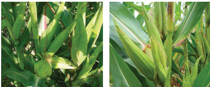
Figure 8. Bouquet ears resulting from crazy top of corn.

It has often been difficult to definitively pinpoint a single cause or interaction of causes that results in multiple ears on the same shank, but a common thread in many cases seems to be some sort of disruption in development of the main ear that weakens its apical dominance and allows other ears to develop on the same node.