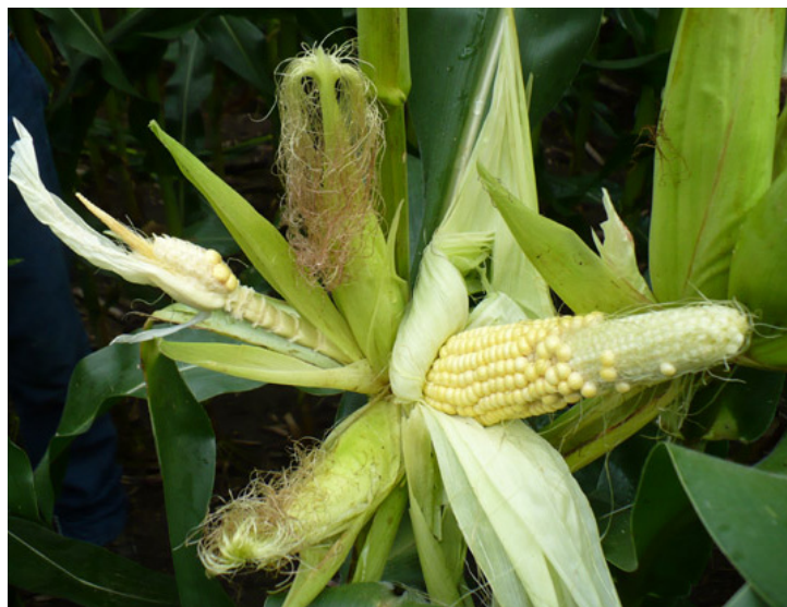
Figure 7. Corn plant showing a cluster of ears at a single leaf node, a condition referred to as “bouquet ears.”

Bouquet ears also appear to be associated with failure of the primary ear. Often, none of the ears will develop properly, and the total yield of the plant ends up being less than what would have been achieved by a single normal ear. The potential to negatively impact yield makes bouquet ears particularly concerning compared to other, less extreme forms of multiple ears on the same shank. In some cases, bouquet ears have been observed throughout a field, affecting the majority of plants. The potential for significant reductions in yield makes it important to try to determine the factor or factors causing bouquet ears, in the instances when they occur.