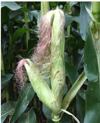
Figure 4. Multiple ears on the same shank with the secondary ear(s) separate from the main husk (left) and contained in the main husk (right).

The most common form of multiple ears on the same shank is a dominant primary ear at the terminal node of the ear shank with one or two side ears emerging from lower nodes on the shank. Sometimes the side ears will be wrapped in the husk with the primary ear and only become noticeable when silks begin emerging from the side of the husk. In other cases, secondary ears are visibly separate from the primary ear.