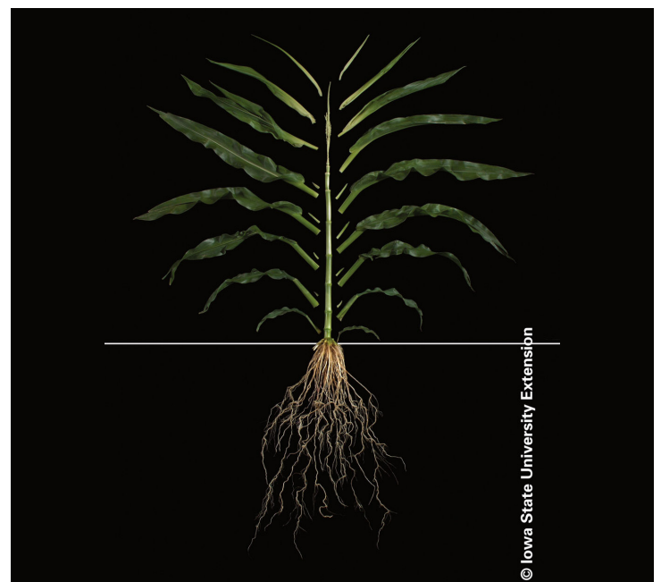
Figure 2. Dissected corn plant at the V12 growth stage. A total of 8 ear shoots are visible with the lowest at node 7 and the primary ear shoot at node 14.

Much as apical dominance in the plant suppresses development of ears at additional stalk nodes, hormonal apical dominance expressed by the primary ear suppresses the initiation of any other ears along the ear shank. This normally prevents the development of multiple ears at the same stalk node.