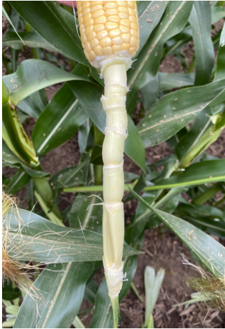
Figure 3. Removing the husk leaves reveals the nodes and internodes of the ear shank.

The ear shank is essentially a miniature version of the main stalk, with multiple nodes and internodes. Leaves emerge from the nodes and an inflorescence is produced at the terminal node. In this case of the ear shank though, the inflorescence at the terminal node is the ear rather than the tassel and the leaves on the shank enclose the ear, forming the husk (Figure 3).